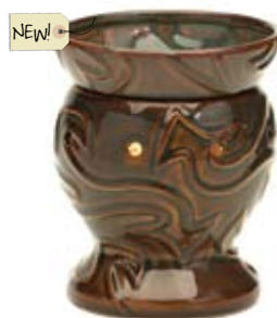
Zeus DSW-ZEUS $30