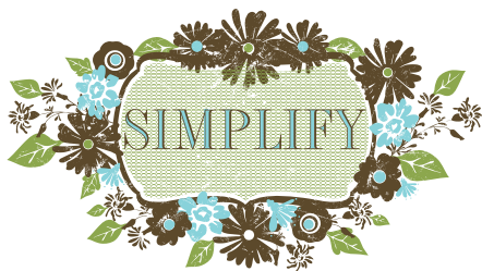
Simplify DIY-TP-SMP $10