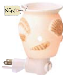
Seashells PSW-SSEA $15