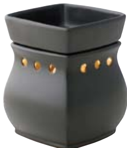
Satin Black DSW-SBLK $30