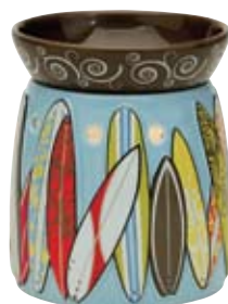
Surf's Up DSW-SURF $30