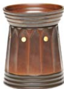
Othello DSW-OTHE $30