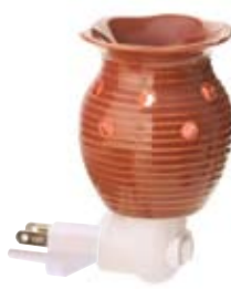
Groovy – Rust PSW-GRUS $15