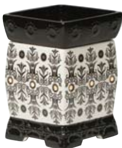
Boleyn DSW-BOLE $30