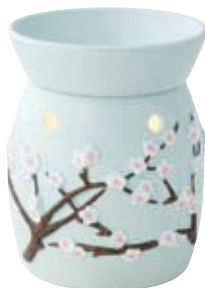
Cherry Blossom DSW-CHER $30