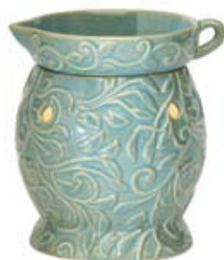
Riviera DSW-RIVI $30