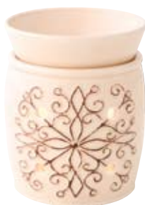
Embellish DSW-EMBE $30