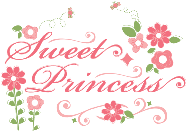
Sweet Princess DIY-TP-SPS $10