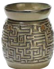
Labyrinth DSW-LABY $30