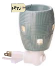
Weave – Denim PSW-WDEN $15