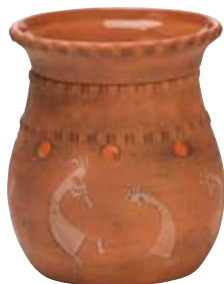
Kokopelli DSW-KOKO $30