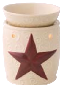
Rustic Star DSW-STAR $30