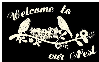
Our Nest DIY-TP-NST $10