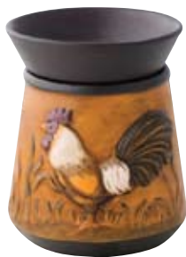
Rooster DSW-RSTR $30