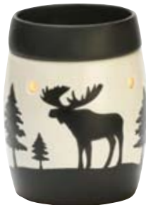
Yukon DSW-YUKO $30