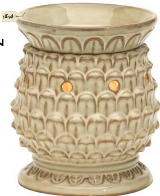
Plantation DSW-PLAN $30

The weathered cream glaze applied over a warm-brown base coat creates an original, unique look.