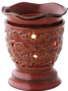
Roma DSW-ROMA $30