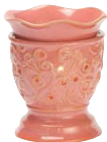
Sweetheart DSW-SWHT $30