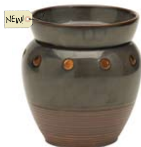
Soapstone MSW-SOAP $25