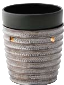
Eclipse DSW-ECLP $30