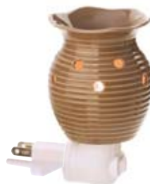
Groovy – Brown PSW-GBRN $15