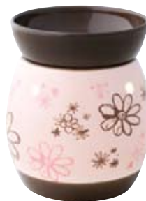
DoodleBud DSW-DBUD $30