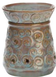
Lisbon DSW-LISB $30