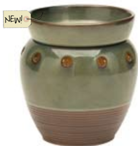
Jadestone MSW-JADE $25

Contrasting textures and finishes enhance the elegant shape and colors of the Smooth Stone Collection. The rustic and grooved design on the lower portion of the base is balanced by the highly polished, nearly iridescent reactive glaze finish on the upper base and dish.