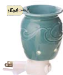
Waves PSW-SWAV $15