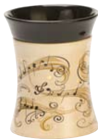
Symphony DSW-SYMP $30