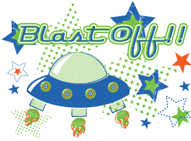
Blast Off DIY-TP-BLO $10