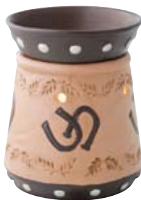
Wild West DSW-WEST $30