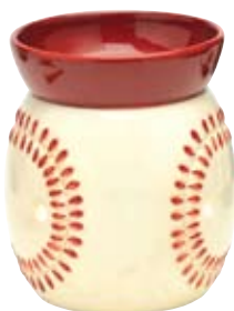
Play Ball DSW-PLAY $30