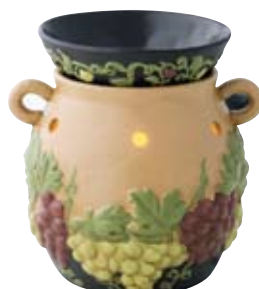
Grapevine DSW-GRAP $30