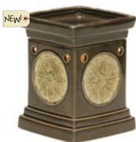
Lotus DSW-LOTU $30