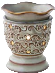
Milano DSW-MILA $30