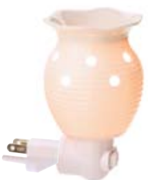
Groovy – White PSW-GWTE $15