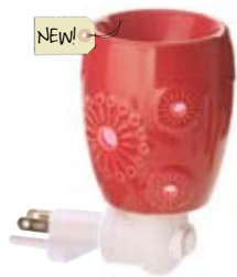
Dandy – Cherry PSW-DCHE $15