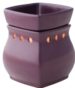
Scentsy Plum DSW-SPLU $30

Scentsy's signature Classic Collection Warmers are available again in Scentsy Plum and Scentsy Green as well as in Cream and Satin Black.