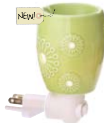
Dandy – Lime PSW-DLIM $15