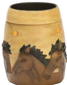
Stampede DSW-STAM $30