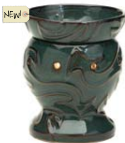
Poseidon DSW-POSE $30