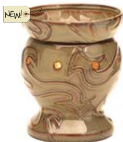
Apollo DSW-APOL $30

Inspired by ancient Greek symbols, the distinctive reactive glaze finish and rich color palette of the Olympus Collection make a dramatic statement in any room.