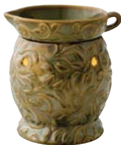
Cyprus DSW-CYPR $30