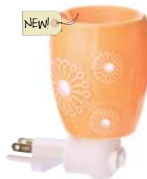
Dandy – Tangerine PSW-DTAN $15