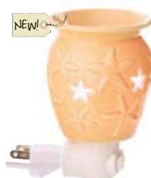
Starfish PSW-SSTA $15