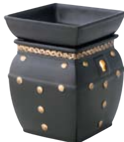
Treasure Chest DSW-TREA $30