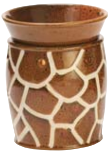
Giraffe DSW-GIRA $30