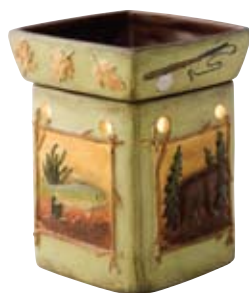
Lodge DSW-LODG $30