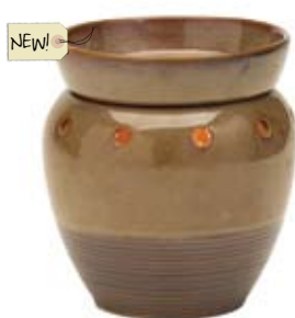
Limestone MSW-LIME $25