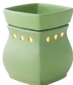
Scentsy Green DSW-SSGR $30