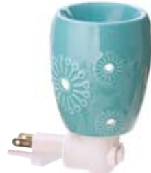
Dandy – Turquoise PSW-DTUR $15