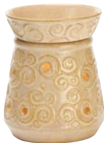
Angora DSW-ANGO $30