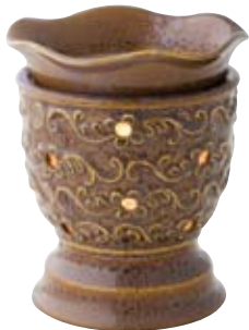
Torino DSW-TORI $30