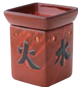
Zensy DSW-ZENS $30