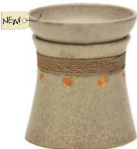
Hatteras MSW-HATT $25