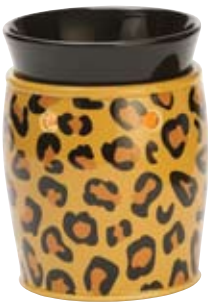
Cheetah DSW-CHEE $30