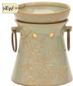
Bamboo Tali DSW-BAMB $30