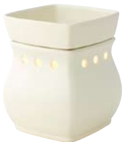
Cream DSW-SCRE $30