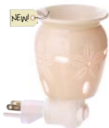
Sand Dollar PSW-SSAN $15

Bring a touch of the ocean into your home with Scentsy's Seaside Collection. Classic beachcomber motifs in glowing porcelain add a unique touch to any décor.