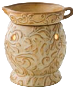
Malta DSW-MALT $30