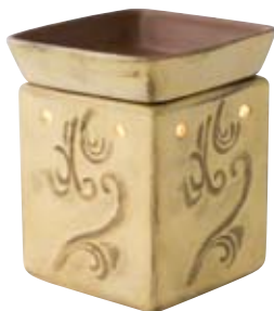
Sandstone DSW-SSTN $30