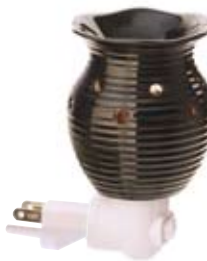
Groovy – Black PSW-GBLK $15