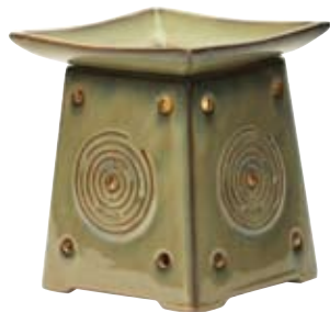
Sendai DSW-SEND $30