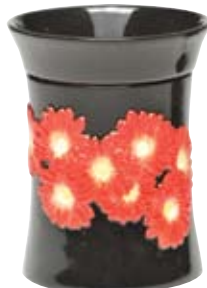
Daisies DSW-DAIS $30