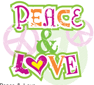
Peace & Love DIY-TP-PLV $10