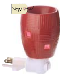
Weave – Scarlet PSW-WSCA $15