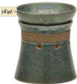
Acadia MSW-ACAD $25

Named for renowned American islands and beaches, the Nautical Collection reinterprets classic coastal details. Matte faux-stone finishes are reminiscent of beach pebbles and rocky coastlines. Rope accents pay tribute to the cordage used on sailing vessels throughout North America.