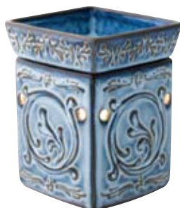
Borneo DSW-BORN $30