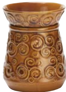
Merino DSW-MERI $30