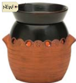
Sonora DSW-SONO $30