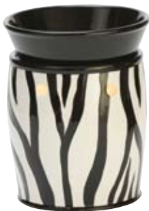
Zebra DSW-ZEBR $30