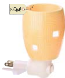
Weave – Buttercup PSW-WBUT $15