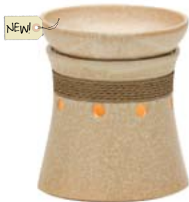
Nantucket MSW-NANT $25