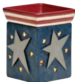
Liberty DSW-LBTY $30