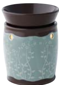
Pembroke DSW-PEMB $30