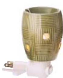
Weave – Green PSW-WGRN $15